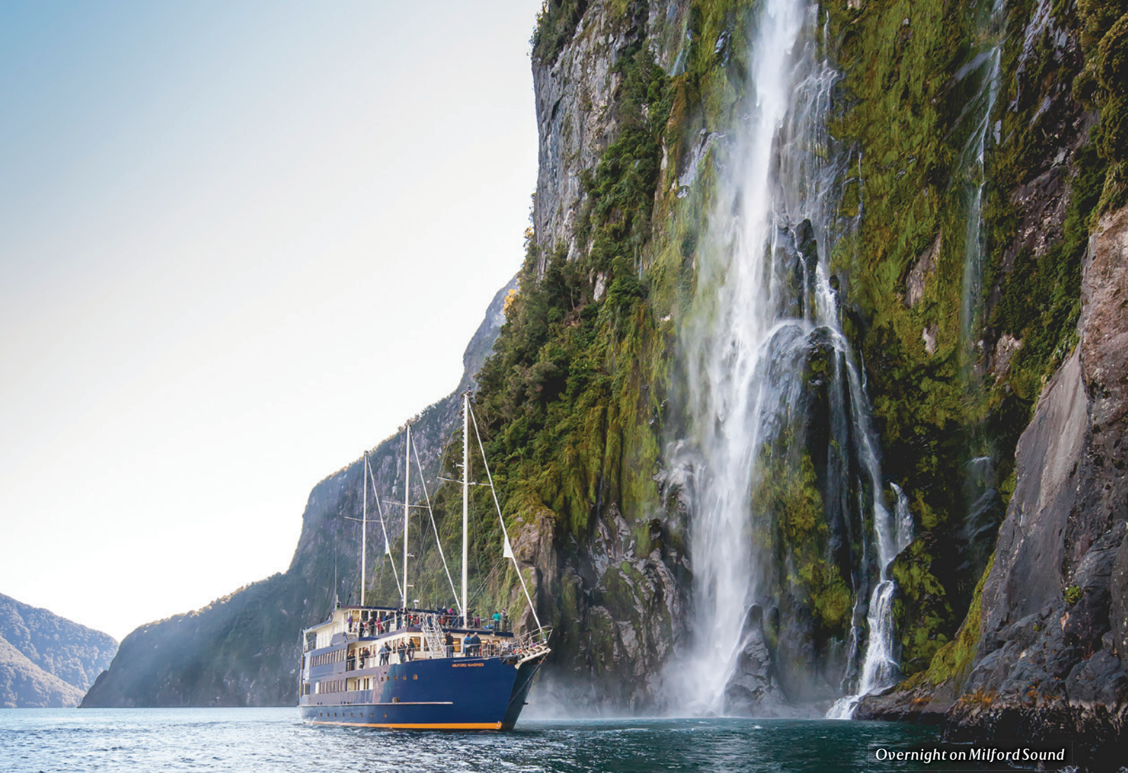
Overnight on Milford Sound