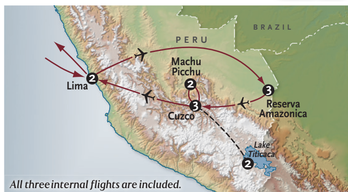
All three internal flights are included.