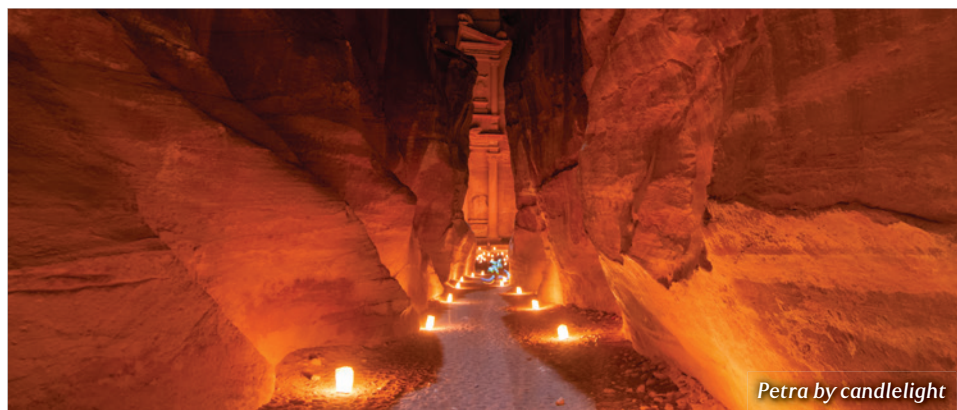
Petra by candlelight

We'll head north to beautiful Galilee ☞. First is Capernaum, a 2nd Century synagogue that illuminates the religious life of Jesus' time. We'll also visit the traditional house of Saint Peter and go on to Tabgha, the site of the 'loaves and fishes' where the third