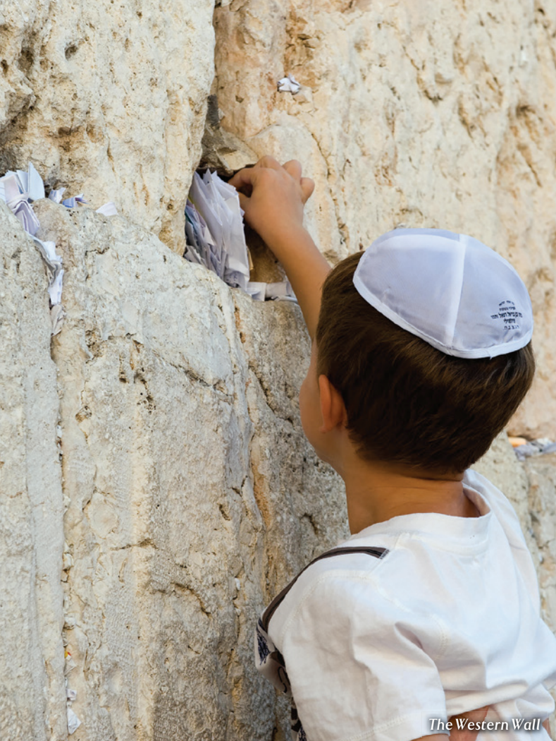
The Western Wall