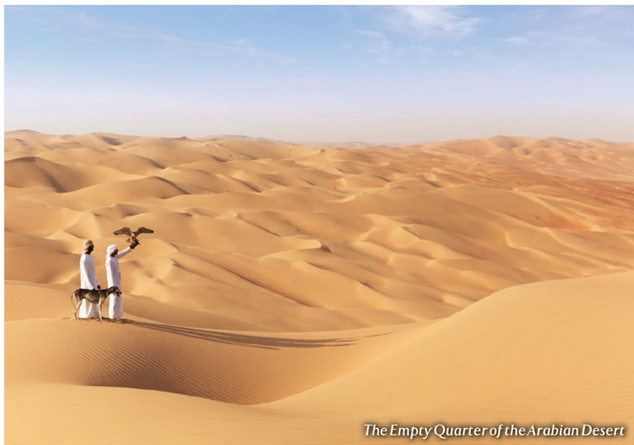
The Empty Quarter of the Arabian Desert