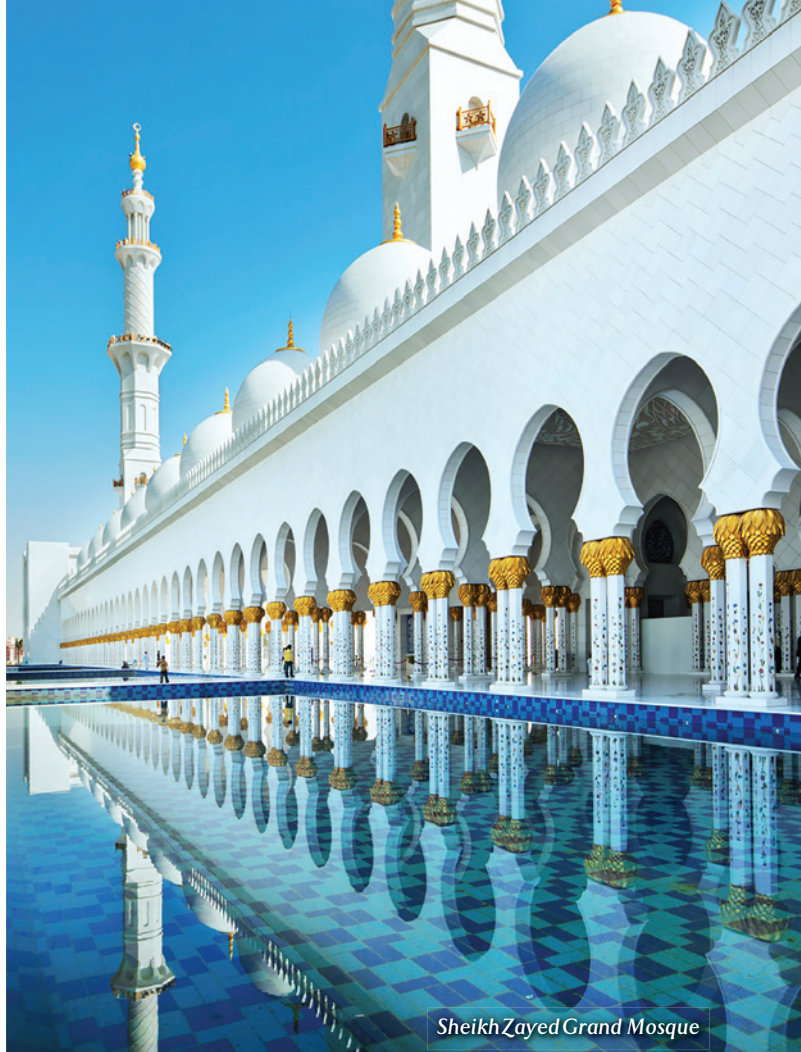
Sheikh Zayed Grand Mosque

resurrection appearance also reportedly occurred. The Mount of Beatitudes, nearby, is the site of the Sermon on the Mount overlooking the rolling countryside and the distant Golan Heights. We'll end with a ride across the gentle waters of the Sea of Galilee.