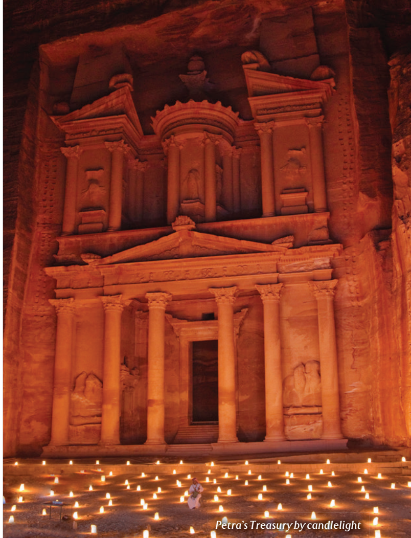
Petra's Treasury by candlelight