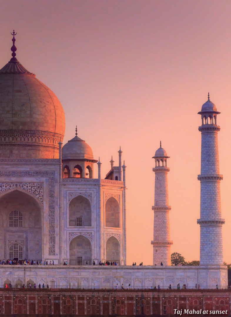
Taj Mahal at sunset