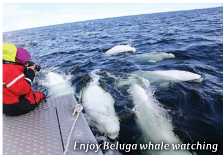
Enjoy Beluga whale watching

You'll be chauffeured to the airport today for your homeward flight. MEALS B