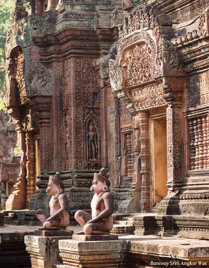
Banteay Srei, Angkor Wat